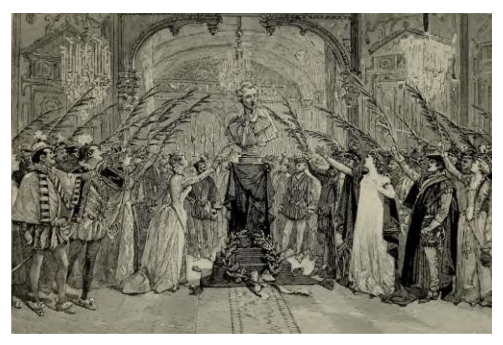
Celebration of Hérold's centenary at the Opéra-Comique