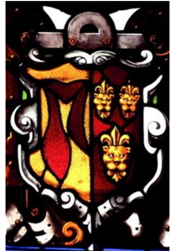
Dining Room 8 Hastings/ Cantelupe

The next window (Dining Room 5) shows the marriage of their son Henry, who took the title of Earl of Huntingdon, and Ada, daughter of William, Earl de Warren. The arms of the Earl of Huntingdon are:-