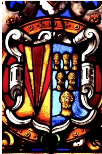
Drawing Room 6 Earl of Huntingdon/ Earl of Chester