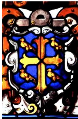
Dining Room 1 Edmund Ironsides