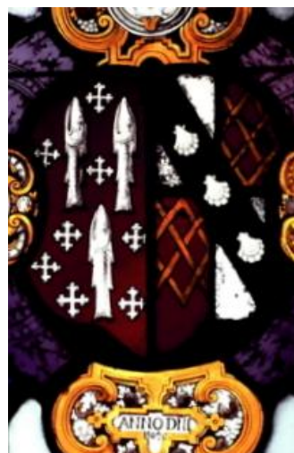
Great Hall 3 Lucy/ Spencer