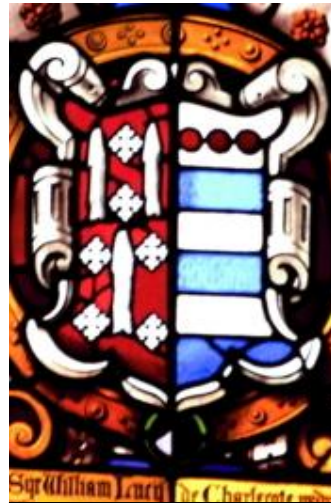
Library 4 Lucy/ De Grey