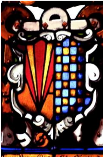
Dining Room 5 Earl of Huntingdon/ de Warren