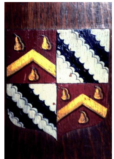
One of the painted shields in the Great Hall showing Abbot quartering Empson