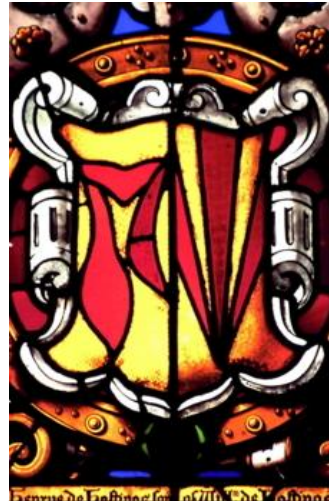
Dining Room 7 Hastings/ Earl of Huntingdon