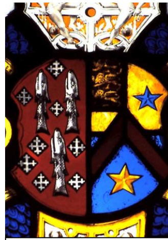
Great Hall 7 Lucy/ Lane