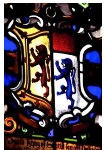
Dining Room 4 King of Scotland/ Earl of Northumberland