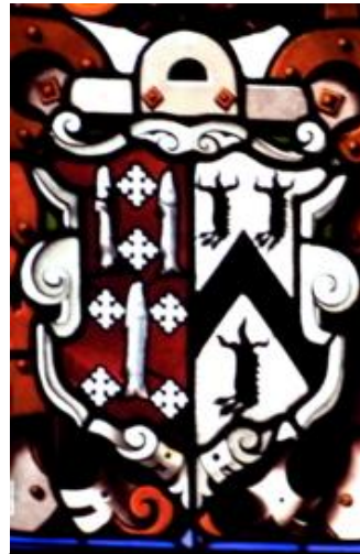
Library 5 Lucy/ Brecknot