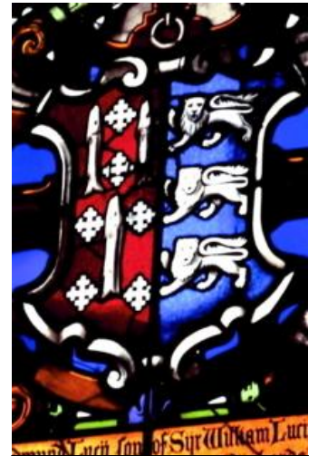
Library 6 Lucy/ Ludlow