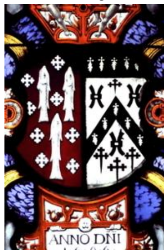
Great Hall 2 Lucy/ Kingsmill