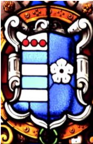
Library 3 De Grey/ Astley