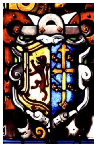
Dining Room 3 King of Scotland/ Edmund Ironsides