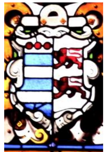
Library 2 De Grey/ Strange