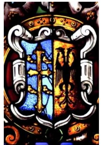
Dining Room 2 Edmund Ironsides/ Emperor of Germany