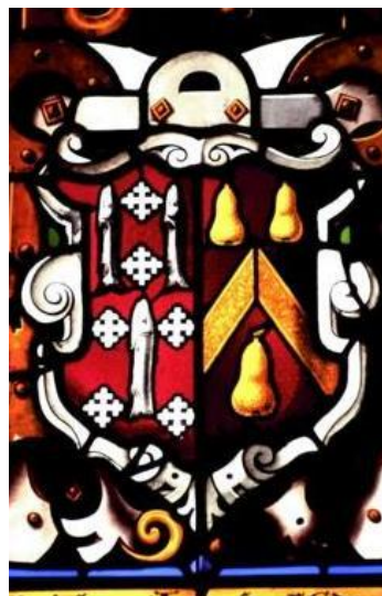
The window by Willement showing Abbot (on the right) where it should be Empson