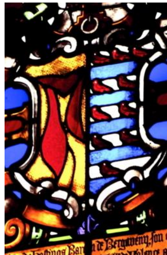
Dining Room 9 Hastings/ De Valance

Their son Reginald married Eleanor, daughter of Roger Strange (Library 2). The Strange arms are:- Argent two Lions passant Gules.