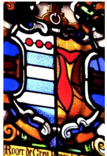
Library 1 De Grey/ Hastings